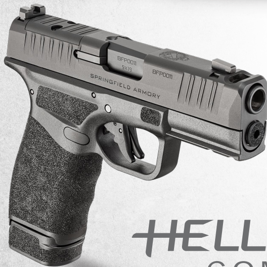
High Capacity Magazine (15+1)